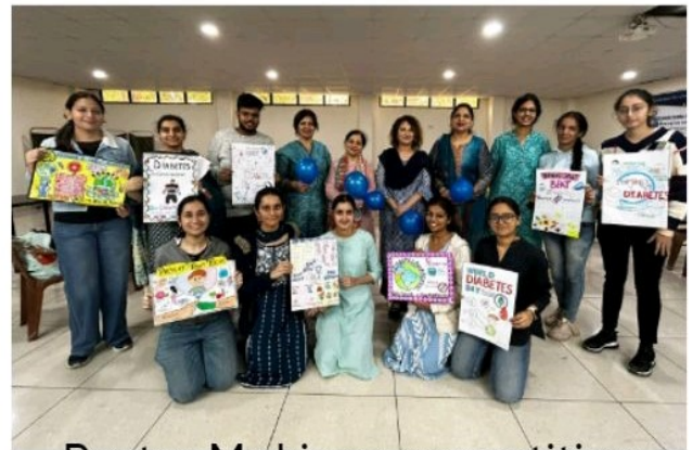
Poster Making competition