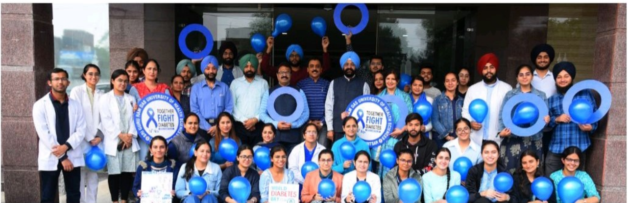
Role play on patient education

Sri Guru Ram Das University of Health Sciences, Sri Amritsar, successfully celebrated World Diabetes Day by hosting role play on patient education, poster making competition etc.